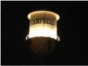
Campbell Water Tower