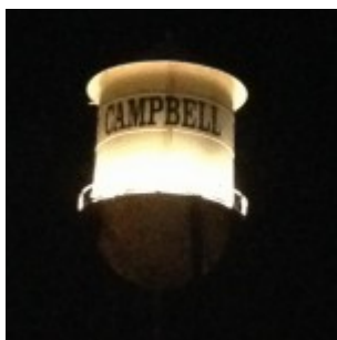
Campbell Water Tower