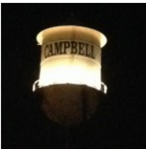
Campbell Water Tower